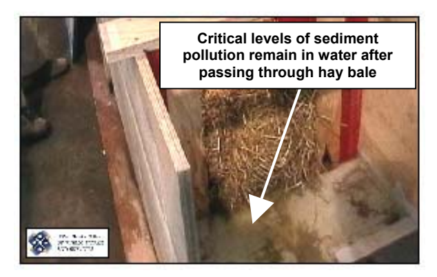
Independent testing by Manly Hydraulic Laboratory (Department of Public Works & Services)