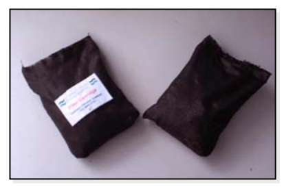
Replaceable filter cartridges

FilterBales ™ contain a tough, polypropylene inner frame that is designed to last for many years and can be used from site to site or fixed into a single position for years of performance. Each FilterBale™ contains two replaceable Filter Cartridges containing Ecomedia ™